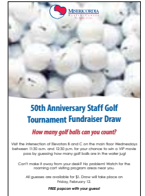
50th Anniversary Staff Golf Tournament Fundraiser Draw How many golf balls can you count?

All guesses are available for $1. Draw will take place on Friday, February 12.