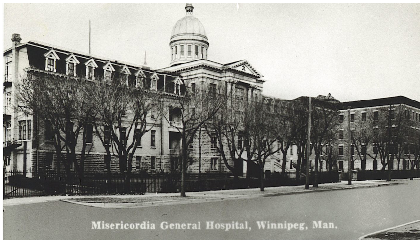
Misericordia General Hospital, Winnipeg, Man.