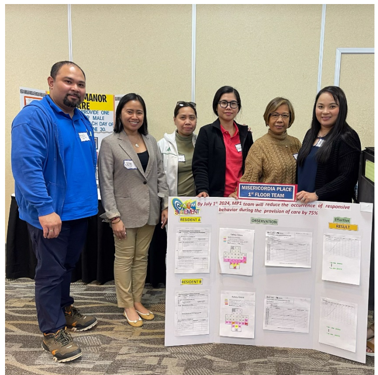
MP team members pose with their vision board

The team's main focus was improving responsive behaviour management, which reduces residents' negative reactions by enhancing their social interactions. This helps diminish feelings of isolation and loneliness. Their goal was to reduce responsive behaviours by 75% by July 2024, a target they surpassed. Our HCAs continue to utilize skills and techniques learned through SHIFT and hope to share successful strategies across other departments to improve resident care and quality of life.