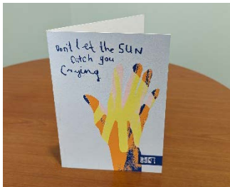
Original MP inspired artwork