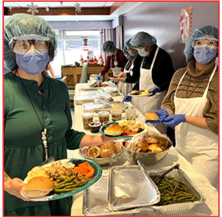
Christmas turkey lunch on MP2

Last week residents from each floor—as well as friends and family—had a chance to partake in a Christmas Celebration Service in our chapel with carols and scripture, followed by baked treats and family photos.