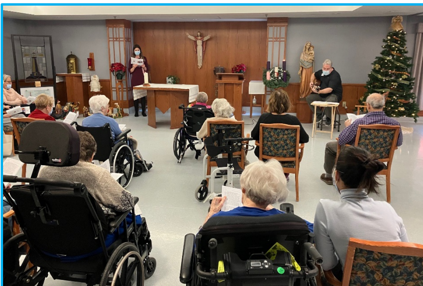
Christmas Celebration Service