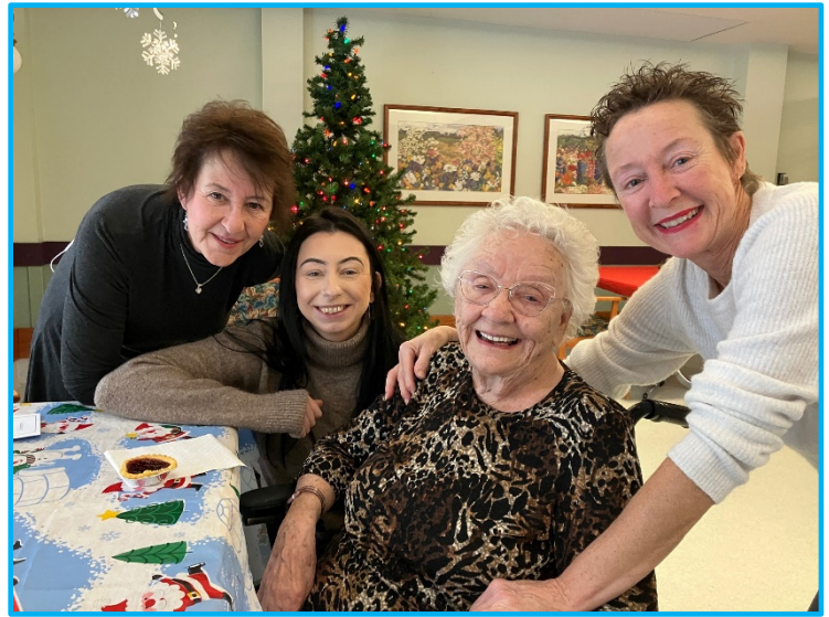
Enjoying treats after the service!

From all of us at MP to all of you, may your season be filled with joy and good health. Merry Christmas!