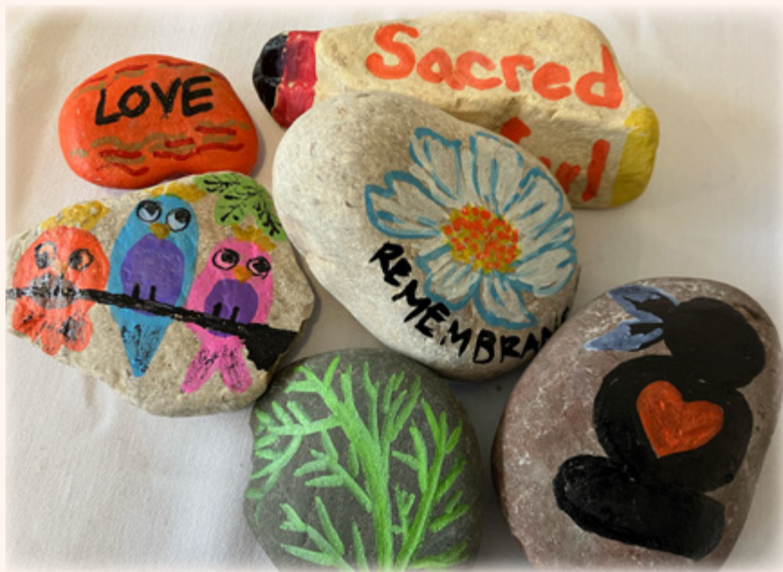
Staff and visitors painted their thoughts about truth and reconciliation on rocks.