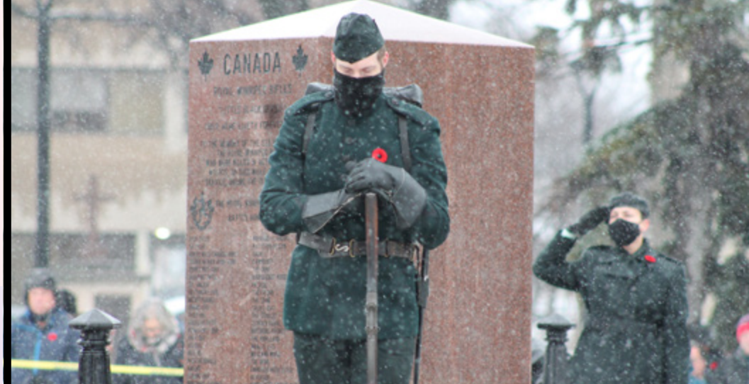
A Royal Winnipeg Rifle skirmisher stands sentry at the cenotaph as the Last Post is played during the Remembrance Day service at Vimy Ridge Memorial Park on November 11, 2021.