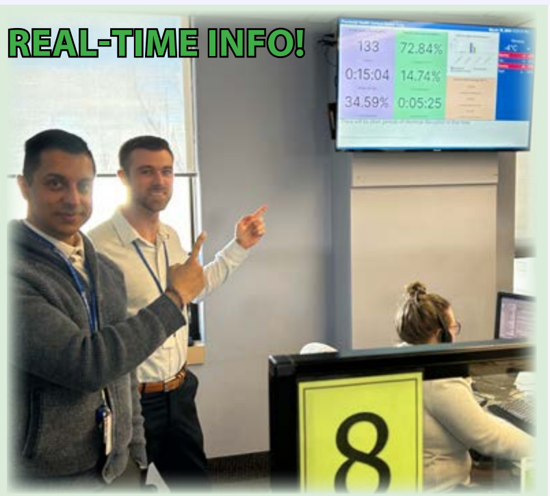
The Provincial Health Contact Centre at MHC recently implemented two new wall-mounted screens.

"I really like to bring the French language to work and engage with people that are either learning it or want to improve their skills."