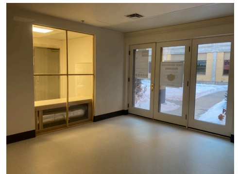
As pictured, the visitation space is connected to MP via the courtyard providing a safe external entrance for visitors.

There are still some finishing touches to be completed, including adding a new window and upgraded doors. This space has increased air circulation, and our Plant Services team will soon receive training on the new air filter system.